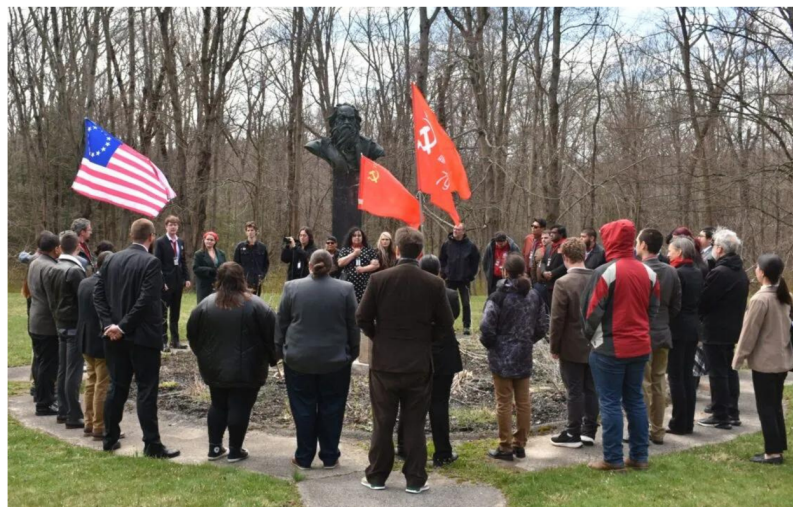
USFSP Delegates and observers laying wreaths at the foot of statues honoring Slavic poets, which was donated by the Soviet Union in the 1970's

USFSP has contacts in all former Soviet Republics, from the Baltics to Central Asia, and especially in the Ukraine and parts of Russia such as Luhansk, Donetsk and Crimea.