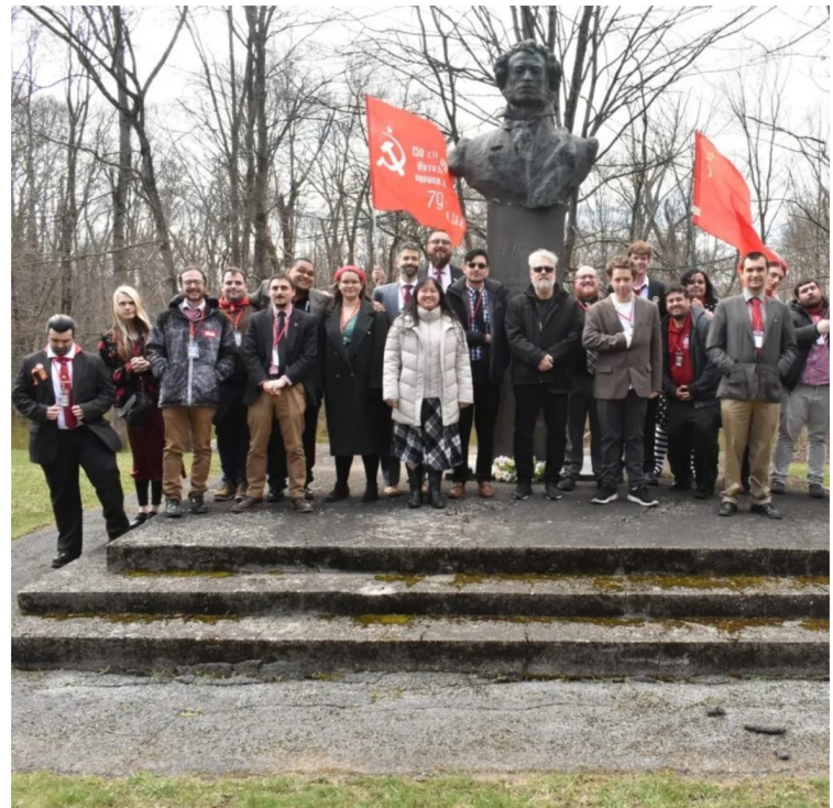
Statue of Afro-Russian poet Alexander Pushkin donated by the Soviet Union

The Congress concluded with the singing of the Paul Robeson song, “The House I Live In.”